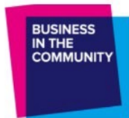
Business in the Community

More details of the External Partners can be found on the Towns Fund website.