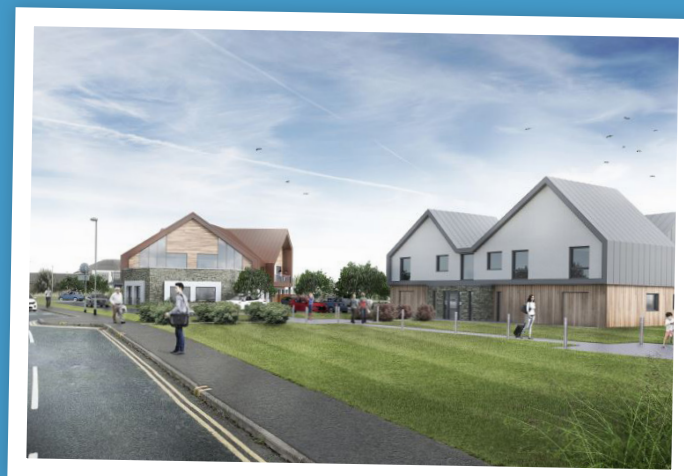
Artist's impression of Campus for Future Living, Mablethorpe © East Lindsey District Council